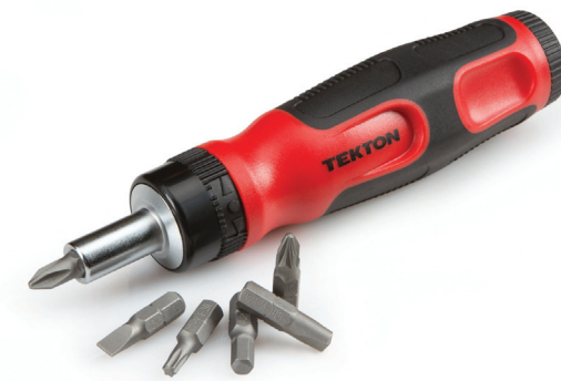
SCREW DRIVER FOR ATTACHING HINGES