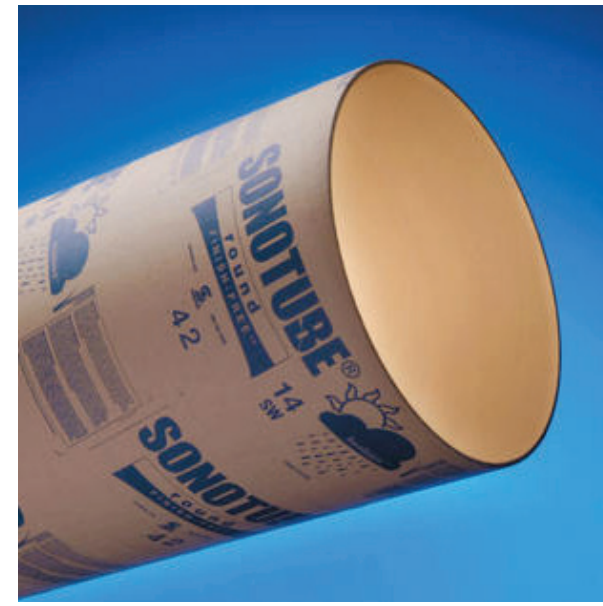
SONOTUBE FOR ENCLOSURES (12", 10", 8")