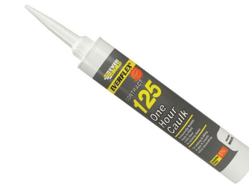
CAULK FOR SEALING THE BACK PLUG