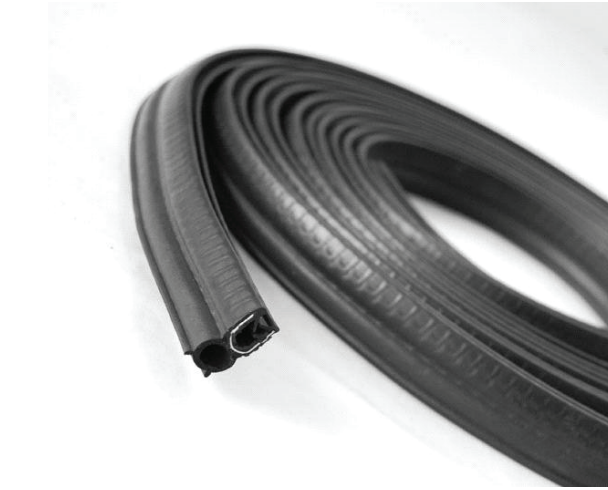
RUBBER EDGE FOR SEAL BEHIND DOOR (ADHESIVE BACK)