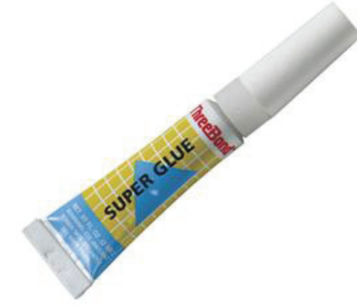
SUPER GLUE FOR HANDLES (12", 10", 8")