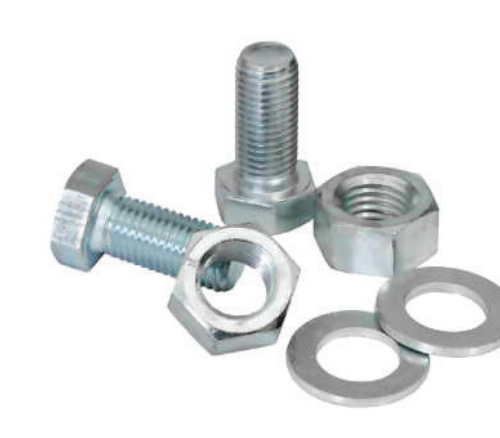
NUTS + BOLTS FOR ATTACHING TUBES TOGETHER (1" LONG)