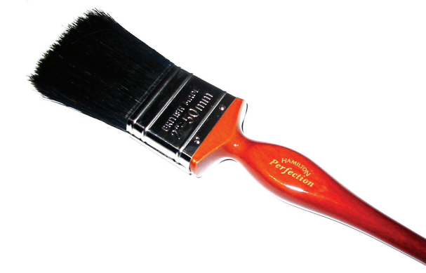
PAINT BRUSH FOR PAINTING TUBES AND DOORS