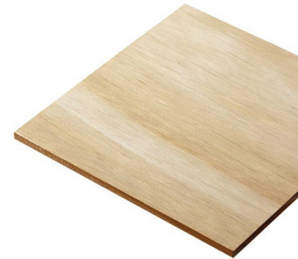
BOARD MATERIAL FOR DOORS AND BACKS (WOOD 1/8"-1/4")