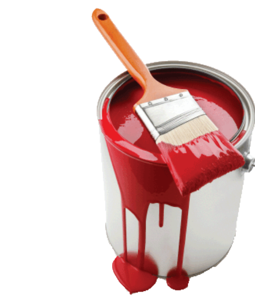
PAINT (EXTERIOR / WATERPROOF)