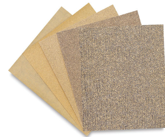
SAND PAPER FOR SMOOTHING TUBE/DOOR EDGES