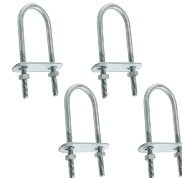
"U" BOLTS FOR ATTACHMENT TO RAIL (3" WIDE)