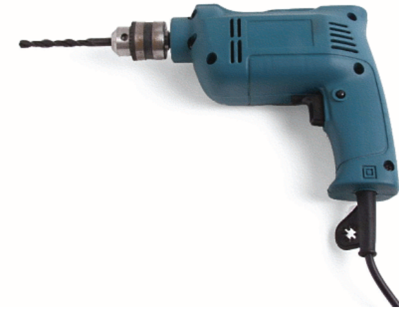
DRILL FOR MAKING HINGE/BOLT HOLES