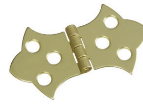
HINGES FOR DOORS (3/4"x3/4")