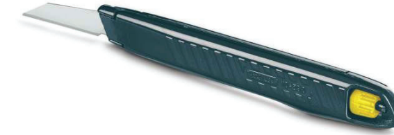
CRAFT KNIFE FOR MAKING STENCILS