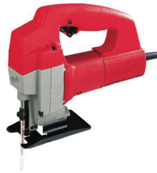
JIG SAW FOR CUTTING TUBES, DOORS AND BACKS