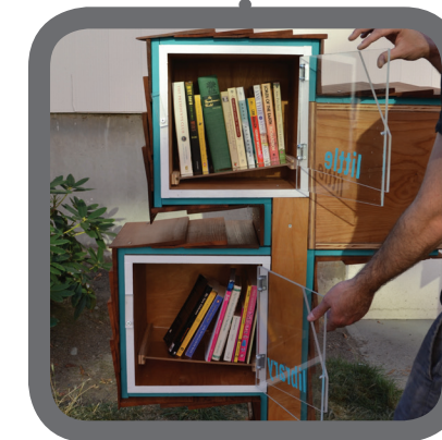
9 / FILL WITH BOOKS