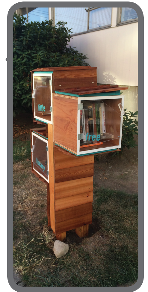
10 / ENJOY!