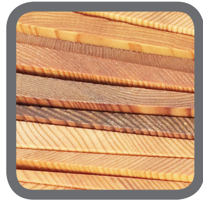
1 / FIND YOUR MATERIALS