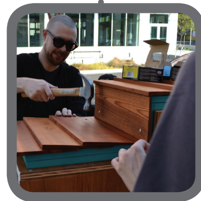
7 / INSTALL THE WRAP