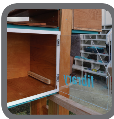
5 / INSTALL DOORS + MAKE THE BOOK ANGLE